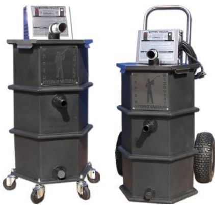
Two optional wheel kits to choose from if you want to add portability.

Caster wheel kit (AHS07), Dolly style wheel kit (AHS06), 50' Vacuum hose (DHV50), Dry operation filter, 3pack (VFBB3), vacuum scupper (ATP75), sand berms (ZMAT2, ZMAT6, ZMAT7), Vacuum accessory bundle (ASF10), Twister Vac surface cleaner/vacuum attachment (ANTV5), Prefilter/Solids/Sand Seperation tank (ATP36), additional attachments available