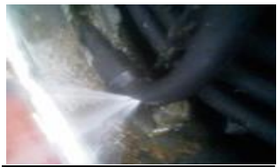
Blow out from pipe weakened by freezing