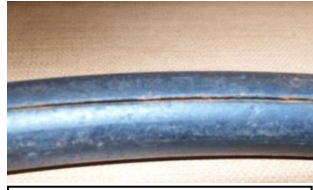
Failed pipe seam covered under warranty