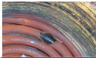
Pipe rupture due to freezing or obstruction

The HE Series (all electric) contains multiple heating elements to generate significant temperature rise in the heat exchange process. The heat exchanger contains a tubular pipe system that directs the water flow through the heating elements.