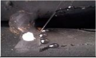
Failed weld or failed material covered under warranty

These pictures show different reasons for coil pipe failure: