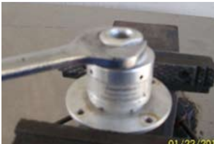
Fig. 1 swivel housing

Be careful not to over-tighten components.