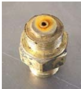
Fig. 4 bottom nozzle