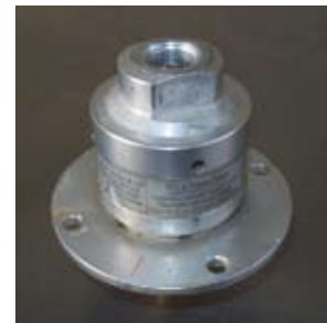
Fig. 5 tighten the swivel cover to swivel plate & retest