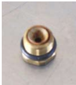
Fig. 3 top nozzle