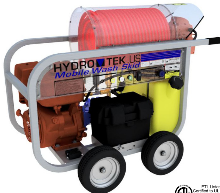
Shown with optional stainless steel frame