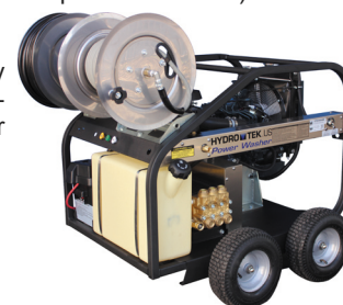
Shown with Wheel kit and hose reel options

8 gallon float tank, Hour meter, Emergency air choke shutoff, Stainless hose reels (150-250ft), Stainless drip pan, Custom color frame, Wheel kit, Trailer and Tank skid