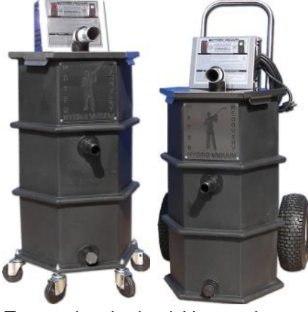
Two optional wheel kits to choose from if you want to add portability.

Caster wheel kit (AHS07), Dolly style wheel kit (AHS06), 50' of 2" Vacuum hose (DHV50), Dry operation filter, 3pack (VFBB3), vacuum scupper (ATP75), sand berms (ZMAT2, ZMAT6, ZMAT7), Vacuum arch (ATP40), Carpet wand (VWV56), Tile wand (VWV62 or VWV63), utility vacuum claw (VWV60), Vacuum accessory bundle (ASF10), Twister Vac (ANTV5, or ANT12) surface cleaner/vacuum attachment