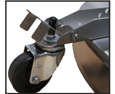
Caster pivot lock allows the operator to choose to lock casters for use in straight lines or unlock for cleaning side-to-side.