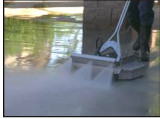
An onboard edging tool cleans close to planters, columns, and walls or use the water broom to rinse a large area