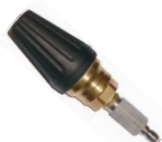
AN040 Turbo Nozzle Assembly