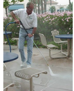
Sidewalk, cages, fountains, and food court cleaning & washing