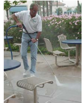
Sidewalk, cages, fountains, and food court cleaning & washing