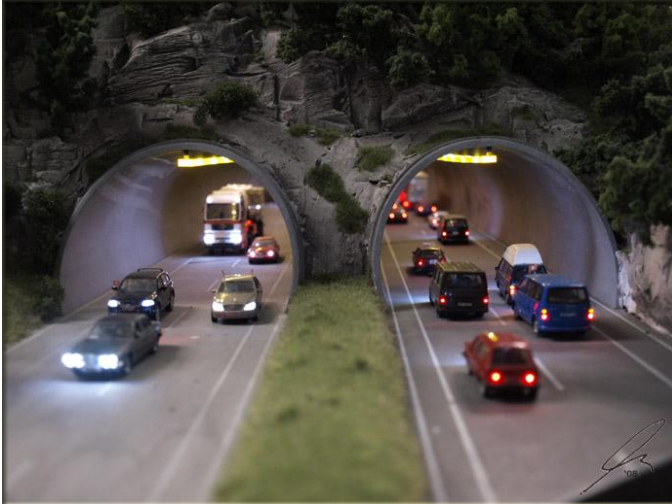
Tunnel cleaning & washing

The SC Series – 2 Gun offers the most versatile hot water pressure washers on the market today. Each skid comes equipped to allow the operator to vary the flow of the machine and reliably handle a two-gun set-up. The system is engineered to uniquely balance 1 or 2 gun operations. This series is powered by industrial engines, hi torque–low RPM belt driven pumps and a burner system with a 2.9Kw generator, providing clean, reliable 115V power for sustained burner operation.