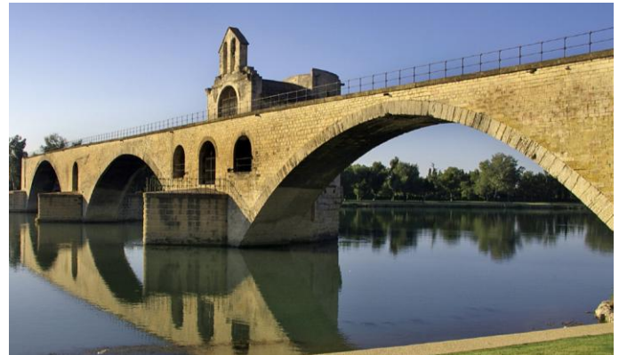
Bridge cleaning & washing