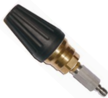
AN050 Turbo Nozzle