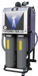
ZVAC – Truck bed/Trailer mounted Recycle System

AHB12 – wheel kit with pull bar steering