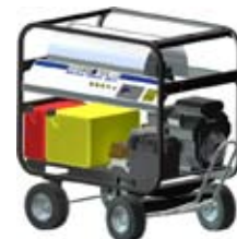
Wheel kit options available

Hydro Vacuum Wastewater Recovery: The SC Series generator will power the Hydro Vacuum AZV system to capture, filter and recycle used wash water, saving time, money and the environment. (Honda powered or 12v models without generator not compatible, use a separate generator and an RZV)