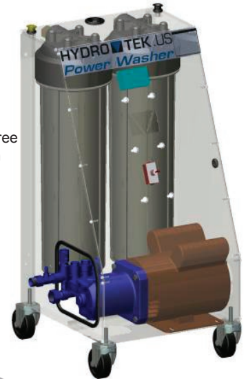
CWD Spot Free model shown