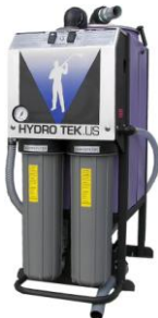
ZVAC – Truckbed/Trailer mounted Recycle System

AHB12 – wheel kit with pull bar steering